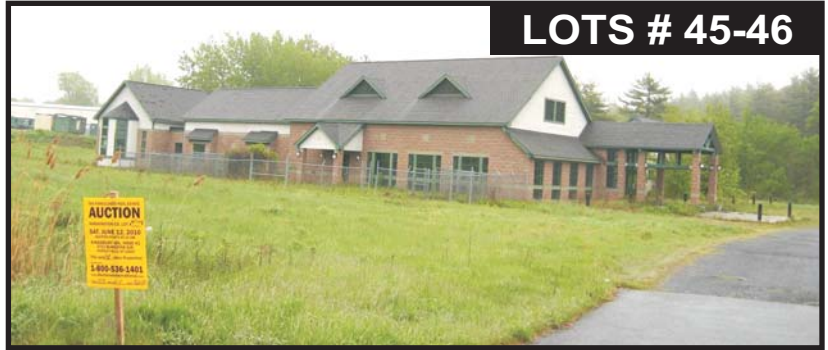
LOTS # 45-46

School Tax: 5519.84 Town/County Tax: 4338.07